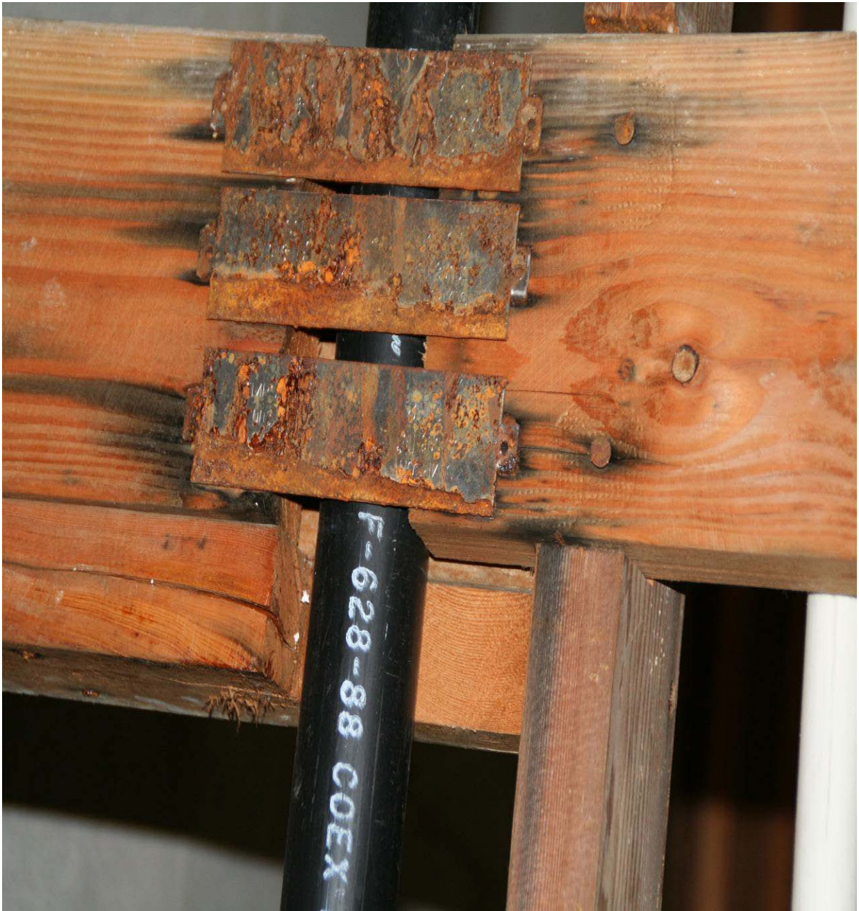
Building framing with wood staining from metal clips (staples).