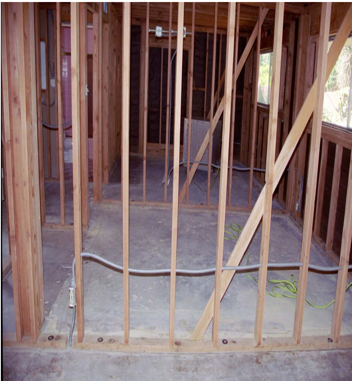
Building framing after mold remediation.